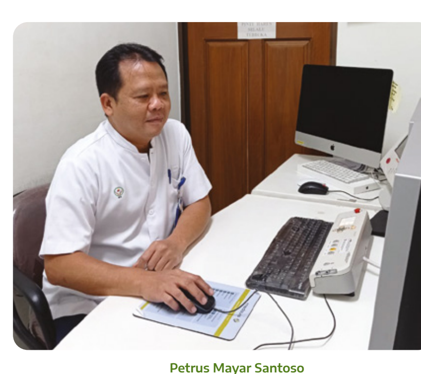
Senior Radiographer Saint Borromeus Hospital

Case Study - St. Borromeus Hospital, Indonesia www.medavis.com Case Study - St. Borromeus Hospital, Indonesia www.medavis.com